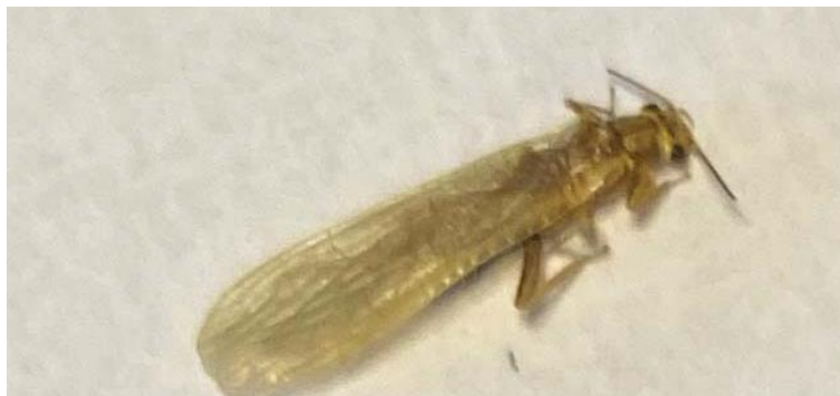
Figure 6. Dorsal view of golden stonefly that swarmed July 27, 2020.

There's another insect that looks similar to a termite and I wanted to share it with you. It was submitted from far eastern TN the same day, July 27, as the light southern subterranean termite specimen above was submitted from southeastern TN. The description is very similar to R. hageni . Good thing I looked closely before replying to the