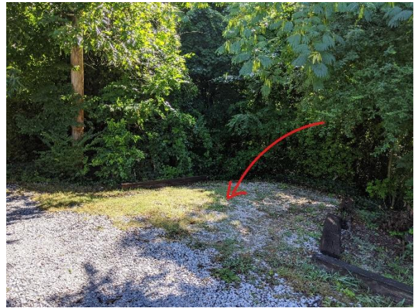
Figure 2. Alates seen swarming from the ground in this gravel parking lot.

It's the end of July and orangish-brown termites are seen flying from the ground in a gravel parking lot in Hamilton County. Most Tennessee pest management professionals expect to see a dark swarmer, so this insect's identity was questioned. Could it be a drywood termite or possibly the Formosan subterranean termite? Well, to answer these questions, I would need answers to a few other items. What is the length of the termite alate, measured from the head's tip to the end of the intact wings? How many darkened wing veins are found on the leading edge of the front wing? Are the wings covered with hairs? While the above photos (Figures 1 and 2) accompanied the submission, the answers to these questions could not be found. I reported the identification I suspected to the PMP, but then requested the specimens to positively identify these mystery termites.