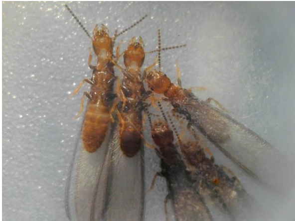
Figure 1. Winged termites submitted to the Hamilton County Extension Office.