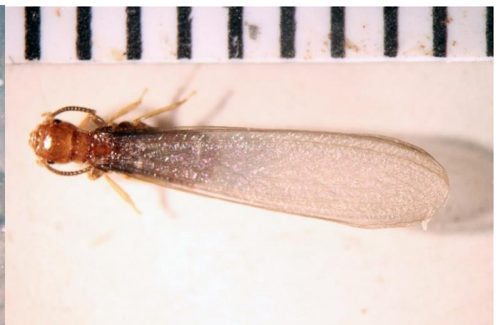
Figure 4. Alate was 8 mm from tip of head to tip of wings.