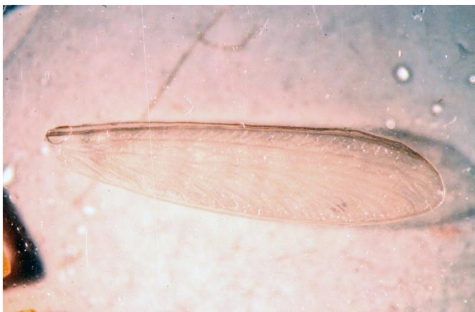
Figure 3. Close up of termite wing.

It's the end of July and orangish-brown termites are seen flying from the ground in a gravel parking lot in Hamilton County. Most Tennessee pest management professionals expect to see a dark swarmer, so this insect's identity was questioned. Could it be a drywood termite or possibly the Formosan subterranean termite? Well, to answer these questions, I would need answers to a few other items. What is the length of the termite alate, measured from the head's tip to the end of the intact wings? How many darkened wing veins are found on the leading edge of the front wing? Are the wings covered with hairs? While the above photos (Figures 1 and 2) accompanied the submission, the answers to these questions could not be found. I reported the identification I suspected to the PMP, but then requested the specimens to positively identify these mystery termites.