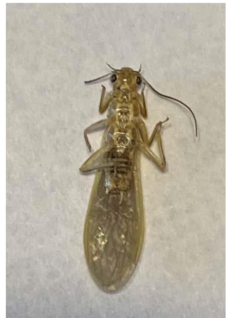
Figure 7. Ventral view of golden stonefly