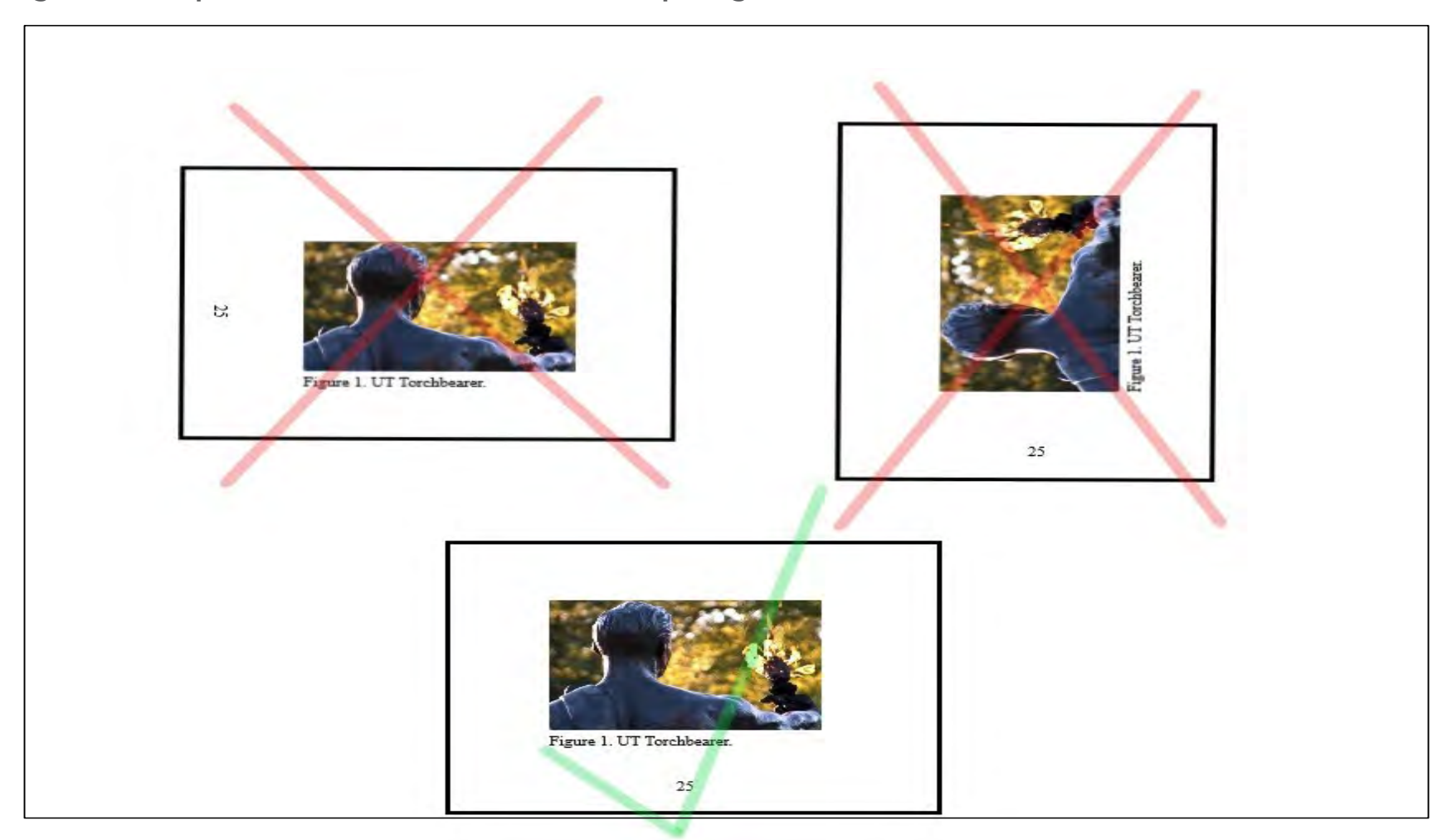
Figure 5: Examples of Incorrect and Correct Landscape Page