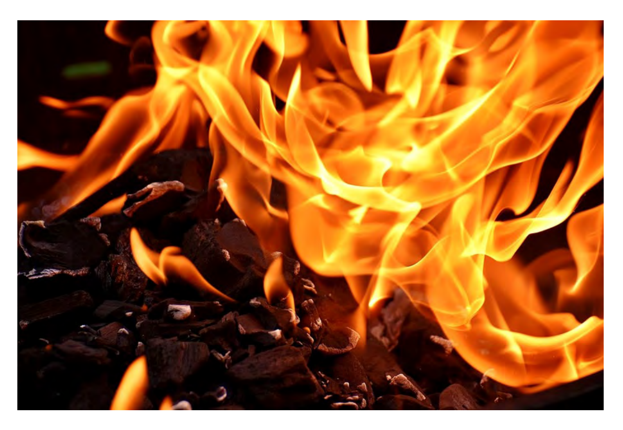
Figure 1. This is a photograph of a fire.