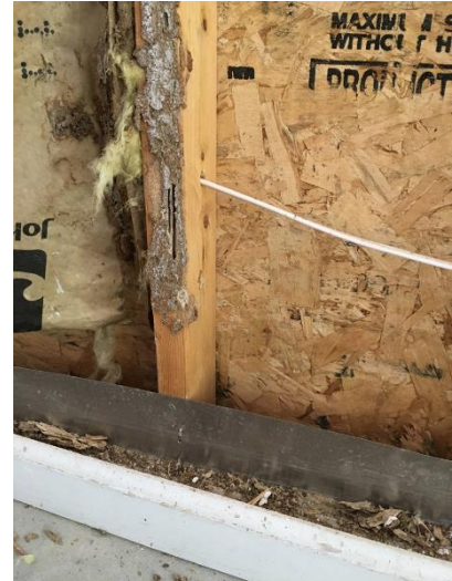
Figure 5. Damage is evident in the garage stud but no mud tubes or other activity reach the ground.

treating the soil for an aerial nest would be ineffective. Either the infested areas need to be treated directly with a spray, dust or foam or aboveground bait stations can be used (Figure 7). FSTs may also be living in trees near the structure. Trees should be inspected and treated by drilling and injecting termiticide or, more easily, by treating with termite baits.