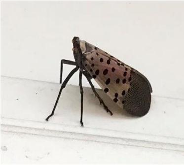
Figure 10. Adult spotted lanternfly adult on the side of a house.

The spotted lanternfly (SLF) is an exotic planthopper that sucks sap from branches and twigs of many plant species and is especially damaging to grape vines and other crops. The tree of heaven is a preferred host. When SLFs build up in large numbers, their honeydew or sticky excrement allows sooty mold to grow, thus discoloring plants and many other surfaces below the plants and further irritating people. In the U.S., SLF was first discovered in Pennsylvania in 2014 and is now established in Massachusetts, Connecticut, New Jersey, New York, Pennsylvania, Maryland, Delaware, Virginia, North Carolina, West Virginia, Ohio and Indiana. Yes, that's northwest North Carolina and southwest Virginia. It's expected to continue spreading and could make its way into Tennessee at any moment. Right now, the spotted lanternfly is in the adult stage (Figures 10 and 11), and females are depositing egg masses. The spread of SLF is often due to egg masses (Figure 12) which can be laid on many surfaces and easily transported by vehicles. See