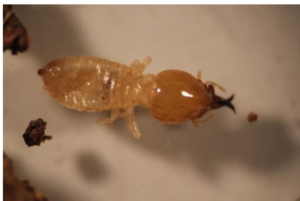
Figure 8. Coptotermes species removed from a boat stored in Roane County, TN.

Formosan subterranean termites can also start as an aerial nest on boats which is especially challenging to manage. Fumigating the boat on the water is an option but Tennessee pest management professionals lack experience as this isn't common. If you're interested in boat fumigation, see https://www.pctonline.com/article/pct0312-performing-termites-treatments/ , check your