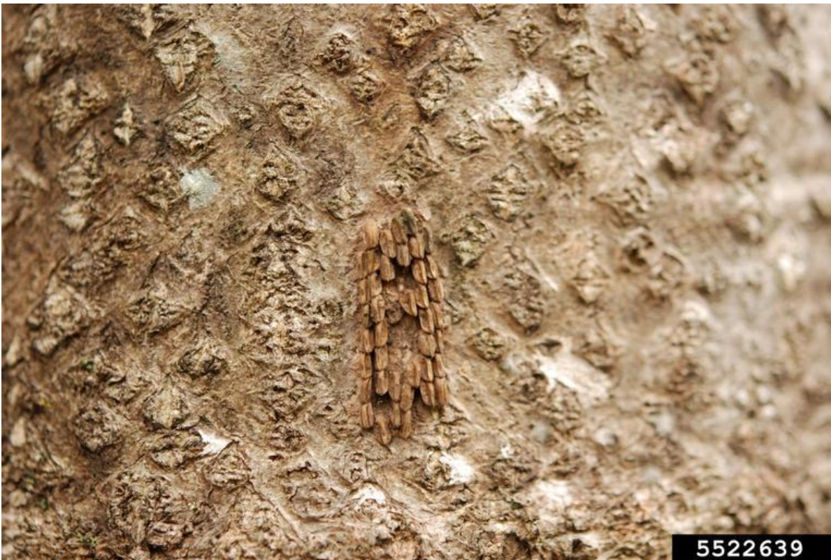
Figure 12. Spotted lanternfly eggmass.