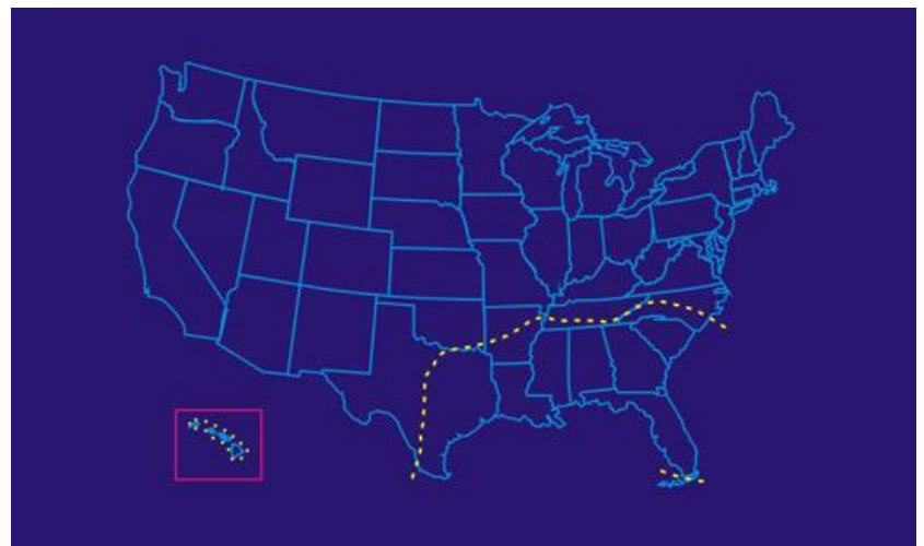
Figure 3. Estimated distribution of the Formosan subterranean termite. Credit: Su and Scheffrahn 2020.

Distribution maps appear to include Tennessee in the range of FST (Figure 3). If you viewed the FST map produced by the ARS Formosan Subterranean Research Unit from the early 2000s it would appear that Shelby County was infested with FST. Not long after my arrival in Tennessee, I had asked Steve Powell, the Tennessee Department of Agriculture's entomologist, for the history of FST in our state and if FST was established. FST was detected in the FedEx airport facility on four occasions from 1984 – 2010 (Table 2). In most cases, pallets from FST territory further south were responsible for the introduction, but there was no evidence that FST had established.