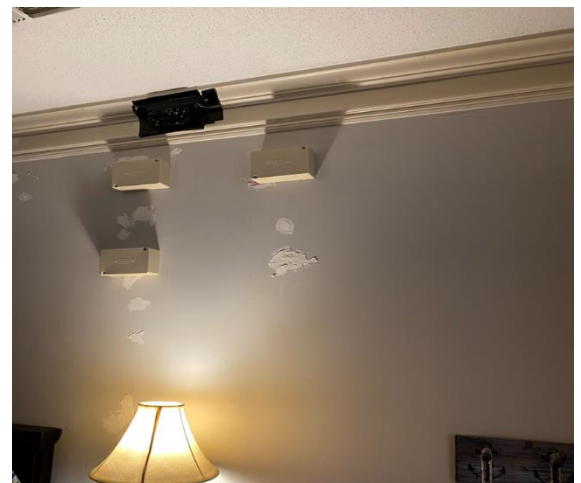
Figure 7. Aboveground termite bait stations can manage aerial nests of Formosan subterranean termites.

Shelby and Henderson counties aren't the only areas where FSTs have been detected in the state. Towards the end of July 2022, I was made aware of