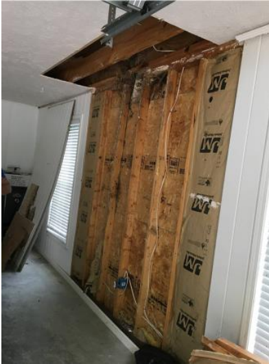
Figure 4. Panelling and ceiling removed to reveal Formosan subterranean termite damage in a Henderson County, TN garage.

Around Mother's Day in 2018, an FST infestation was found in Henderson County. Termites were feeding in a garage and room above. Once the garage panelling was removed (Figure 4), FST feeding evidence was apparent in a garage stud, but no mud tubes extended to the soil (Figure 5). When the ceiling/floor and part of the drywall in the room above were removed, wood damage was apparent (Figure 6A) and a carton nest was found (Figure 6B). A leaking window provided the moisture needed for aboveground survival (Figure 6C). Aboveground nests are a fairly common occurrence for FST. In one Florida study, 25% of the FST infestations had no ground connection and were considered aerial nests (Su and Schreffrahn 2019). Aerial nests present challenges because mud tubes aren't seen between the ground and structure and infestations often go undetected until a swarm occurs. Also,