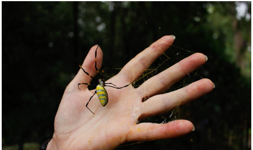
Figure 9. A female Joro spider, Trichonephila clavata on the hand of a female Georgia Extension Specialist. Note the size of the spider and its golden web.

Many people get excited as football season nears. But, as an entomologist, I'm holding my breath to see what new exotic pests are brought to the region via vehicles. Cars, trucks and boats from the southeast and beyond made their way to Knoxville on Thursday, September 1, for the University of Tennessee's first game of the season. The University of Tennessee monitors exotic agricultural pests through the Cooperative Agricultural Pest Survey (CAPS). Still, the more eyes searching, the more likely we are to find these pests. It often takes a while for pest populations to increase before they are noticed, but if we actively search for them, they may not get a chance to establish. Recently, citizen science has grown in popularity and has been beneficial in delimiting the distribution of many insect species. So, here we call upon you to aid in the discovery of these unwanted arthropods.