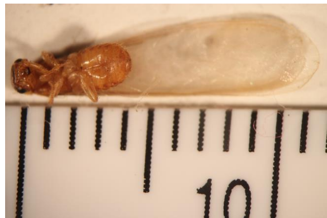
Figure 2. The yellow-brown Coptotermes formosanus alate is 12 - 15 mm long. Its wings are covered with hairs.