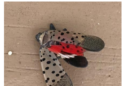
Figure 11. Crushed adult spotted lanternfly showing the red, black and white hind wing.

https://nysipm.cornell.edu/environment/invasive-species-exotic-pests/spotted-lanternfly/