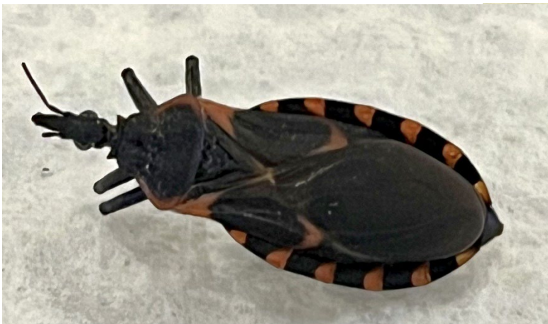
Figure 2. Close up of dorsal view of the suspect Triatoma sanguisuga