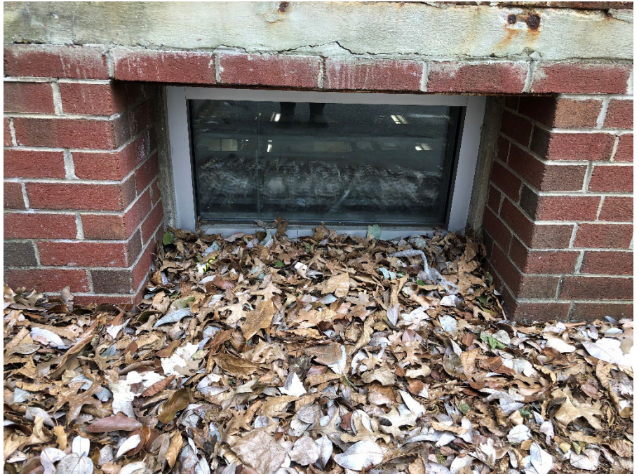
Figure 5. Move leaf piles away from the structure to reduce harborage for kissing bugs.

I once had someone with kissing bugs in the middle of extensive home renovations. They should have slept under fine mesh netting in this situation because they could not exclude the kissing bugs.