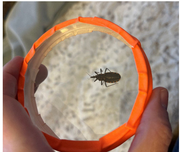
Figure 1. Insect suspected as Triatoma sanguisuga .

She wondered if the insect in Figure 1 was Triatoma sanguisuga , also known as a kissing or cone-nose bug. Additional images were sent upon my request (Figures 2 and 3). She wanted the identity confirmed before requesting testing for Chagas disease.