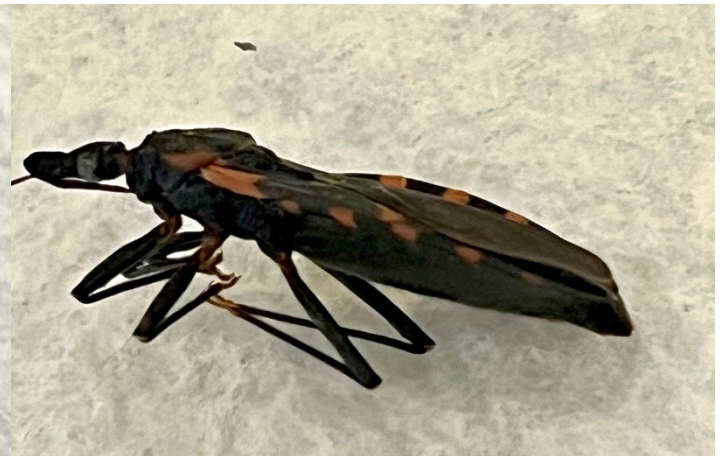
Figure 3. Close up of lateral view of the suspect Triatoma sanguisuga .