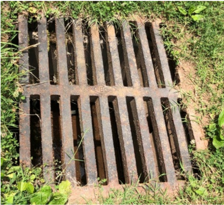
Figure 9. The drainage system runs through the grass on the north side of the school and before the red shale bank.