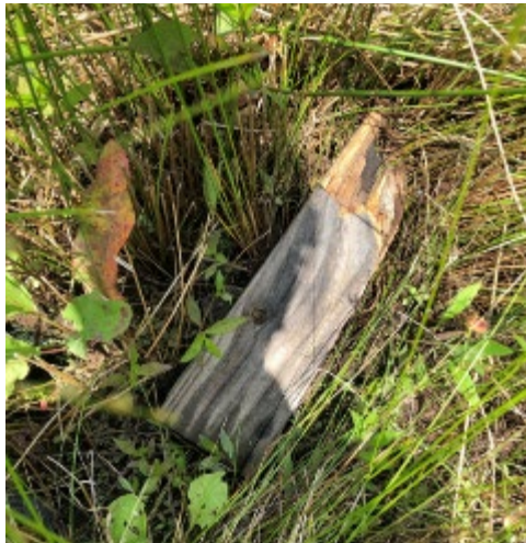
Figure 14. A board sitting on the ground in the wet area.