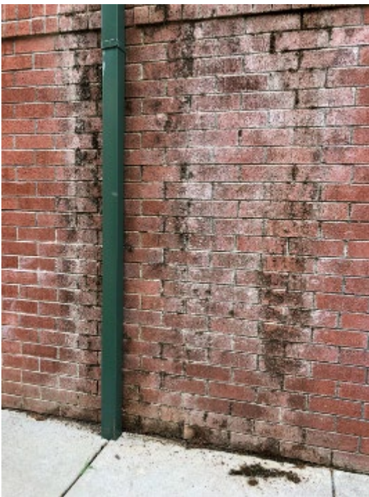
Figure 11. Moss growing on the exterior of the building was probably due to a prior drainage system or damaged roof.

Moisture sources were abundant at this school. Drain pipes ran through the area behind the school. That is, between the school and a steep red shale bank. Condensation from the AC unit emptied into a drain (Figure 7) and sure enough, millipedes were enjoying this area too (Figure 8). Observation through a drain covering in the grass (Figure 9) yielded the same result of numerous millipedes, but this time they were alive (Figure 10).