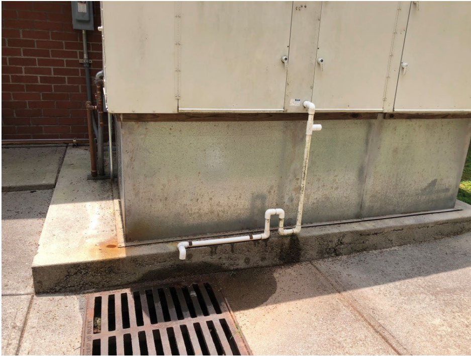
Figure 7. Condensation from the AC unit is led to the drain.

The more we explored, the more we discovered this place was a paradise for millipedes. As we continued our inspection, we saw chalk on the sidewalk and set out to observe the artwork (Figure 5). However, we very quickly noted the art was not our main attraction; a tremendous number of millipedes were enjoying the art too (Figure 6).