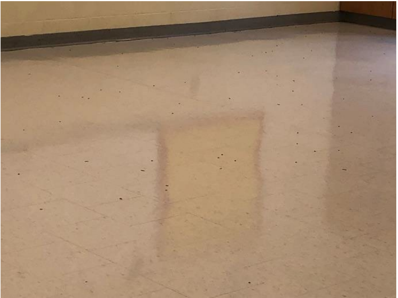
Figure 4. Living and dead millipedes scattered across the interior of a classroom.

We reached the gym to find it being used, but still found many millipedes scattered about. Figure 4 shows an example of these pests scattered over a classroom floor.