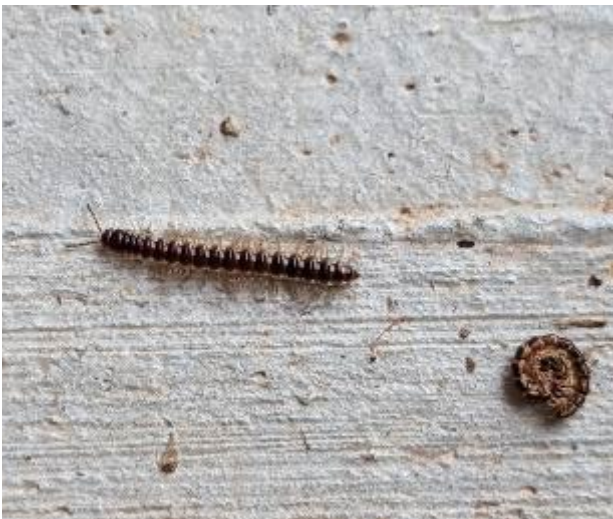
Figure 2. The millipedes found at this school were Oxidus gracilis (C. Koch), a common invasive species.

We started walking around the school's perimeter on our way to the gym in the northeast corner. It didn't take long for us to encounter the first of many Oxidus gracilis (C. L. Koch), commonly called a garden, greenhouse, hothouse or short-flange millipede (Figure 2). We saw millipedes just about everywhere we looked. Occasionally we would stop to take a photo (Figure 3).