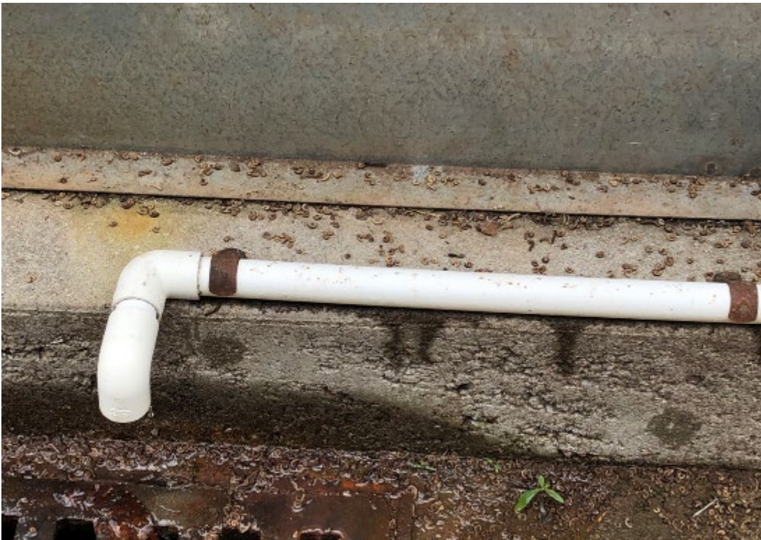
Figure 8. Upon closer inspection, millipedes were also abundant here.