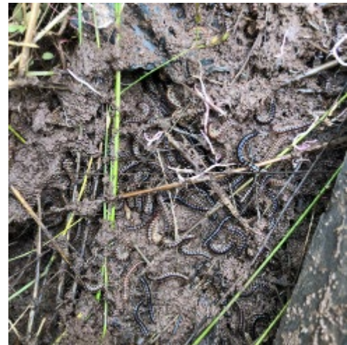
Figure 15. An abundance of millipedes living under the board in Figure 14.

If you look at the image in Figure 1, note the bare area on the north side of the school. That's a steep bank of red shale (Figure 16). The many cracks and crevices in this bank could provide harborage for millipedes. Poking around in a shady part of this bank led us to a scorpion, probably Vaejovis carolinianus (Beauvois), the southern unstriped scorpion also called the southern sun devil. We brought it and some of the rocks and soil, along with a few millipedes, back to the lab to observe interactions between the two. We were surprised that our scorpion was a female - the young we later found on her back led us to this discovery (Figure 17).