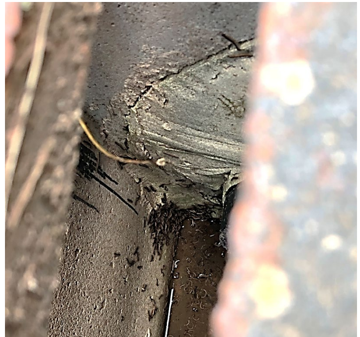
Figure 10. Peeking between the drain slats we noticed a clump of living millipedes.

Moisture sources were abundant at this school. Drain pipes ran through the area behind the school. That is, between the school and a steep red shale bank. Condensation from the AC unit emptied into a drain (Figure 7) and sure enough, millipedes were enjoying this area too (Figure 8). Observation through a drain covering in the grass (Figure 9) yielded the same result of numerous millipedes, but this time they were alive (Figure 10).