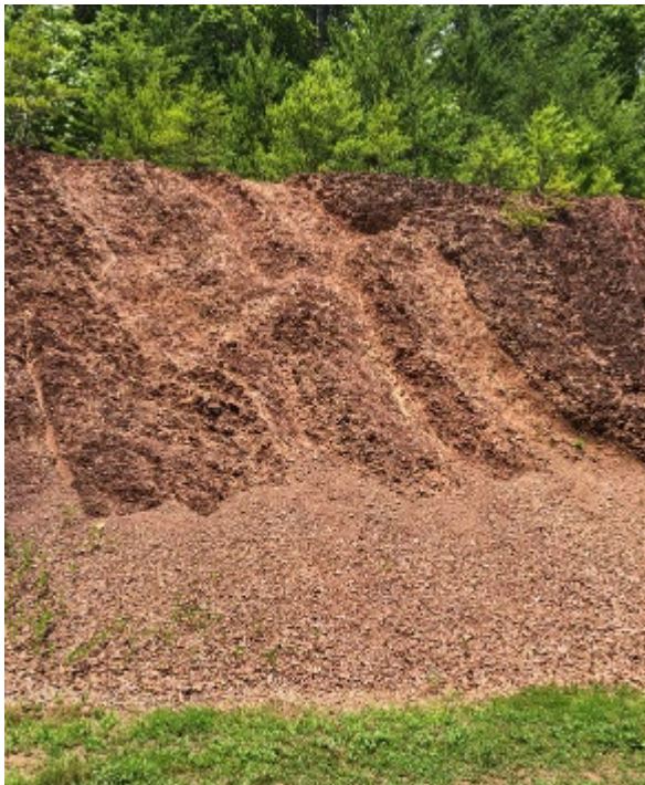
Figure 16. A steep red shale bank with many cracks and crevices for millipedes to hide, runs the entire north side of the school about 20 - 40 feet from the building.

If you look at the image in Figure 1, note the bare area on the north side of the school. That's a steep bank of red shale (Figure 16). The many cracks and crevices in this bank could provide harborage for millipedes. Poking around in a shady part of this bank led us to a scorpion, probably Vaejovis carolinianus (Beauvois), the southern unstriped scorpion also called the southern sun devil. We brought it and some of the rocks and soil, along with a few millipedes, back to the lab to observe interactions between the two. We were surprised that our scorpion was a female - the young we later found on her back led us to this discovery (Figure 17).