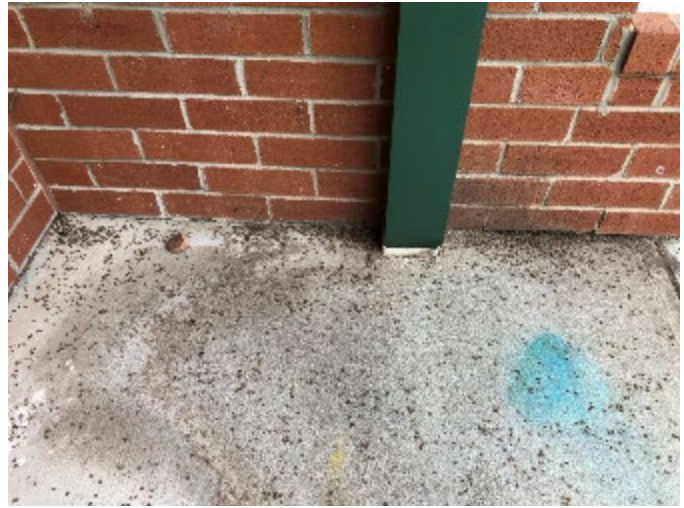
Figure 6. A tremendous number of millipedes were found in this corner close to the downspout.