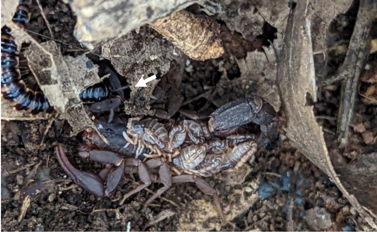
Figure 17. The southern sun devil with young on her back. Note that a millipede rests in the joint just before her pedipalps or pinchers (arrow) leading us to believe that scorpions do not prey on millipedes.

vacuumed, whether dead or alive. I can't find a good solution for this situation, but I'm open to any suggestions. Anyone wanting to sponsor a research study, please contact me.