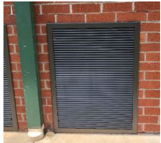
Figure 19. Each exterior room has a vent that would be difficult to screen, allow air flow and keep millipedes out.

For more details on managing millipedes, see