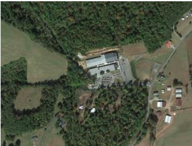
Figure 1. A rural Tennessee school surrounded by forest on three and a half sides. To the east is a septic drain field and parking lot.