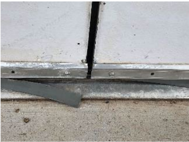
Figure 18. Damaged door sweeps and gaps between doors. Brush sweeps and astragal (brush between the doors) would seal the doors better.