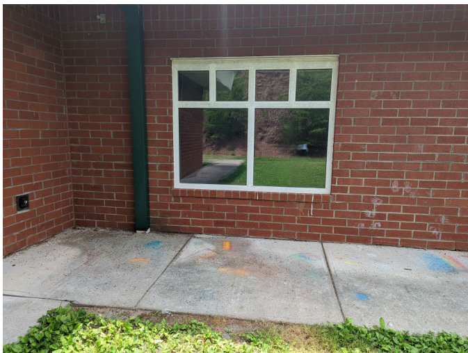
Figure 5. Chalk art drew us to this section, but it wasn't the main attraction.

We reached the gym to find it being used, but still found many millipedes scattered about. Figure 4 shows an example of these pests scattered over a classroom floor.