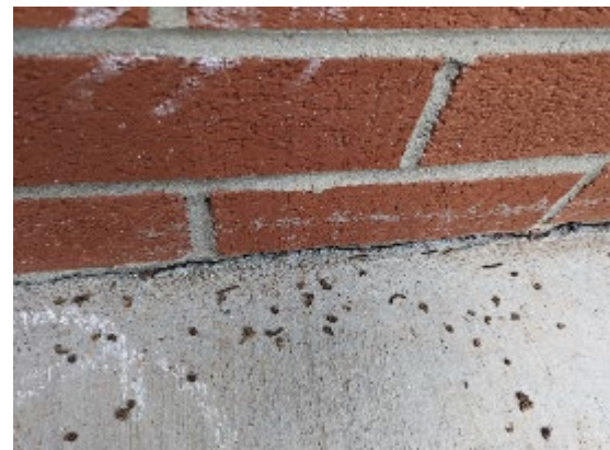
Figure 3. Dead millipedes from insecticide applications to the exterior perimeter.