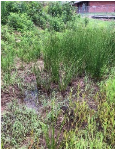
Figure 13. A small wet area on the northwest corner of the school.

As we made our way around the school, we noticed a few more areas possibly conducive to millipedes. Northwest of the school, I'm uncertain if it's on their property or not, we noted a small wet area (Figure 13). Sure enough, we lifted a board sitting on the ground (Figure 14), and found an abundance of thriving millipedes (Figure 15). But the story doesn't end there.