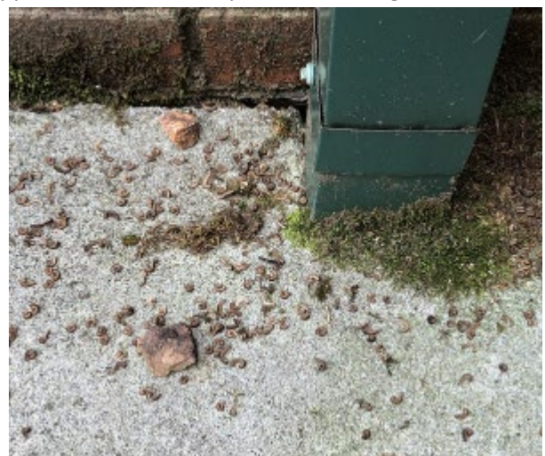
Figure 12. Millipedes were abundant at the base of this downspout too.

We were impressed with the downspouts and the drainage system at this school. We typically find downspouts stopping before ground level and leaving draining water to create giant puddles below, concerning us about mosquito larvae living in the puddle, or springtails, millipedes, and pillbugs feeding on the moist, decaying matter that follows. However, these downspouts were in reasonably good shape and appeared to lead neatly into an underground drainage system. Moss growing on the side of this building (Figure 11) indicates moisture problems above. The millipedes were abundant here too (Figure 12).